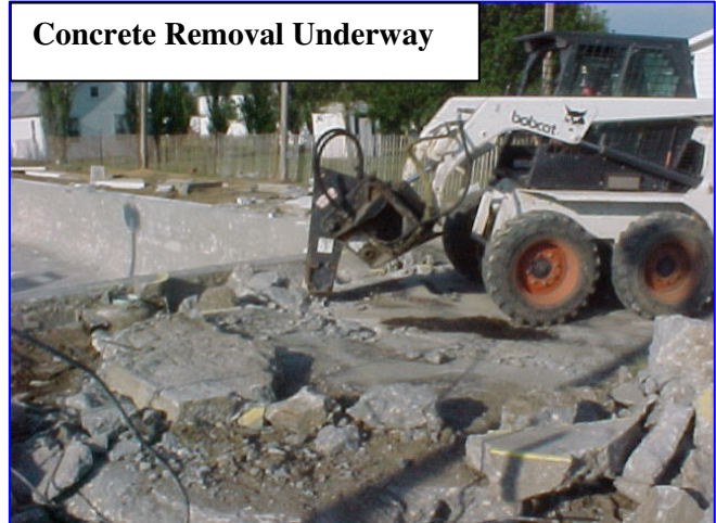
Concrete Removal Underway