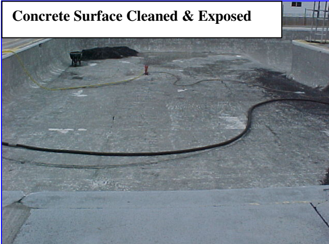
Concrete Surface Cleaned & Exposed