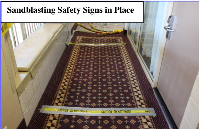
Sandblasting Safety Signs in Place