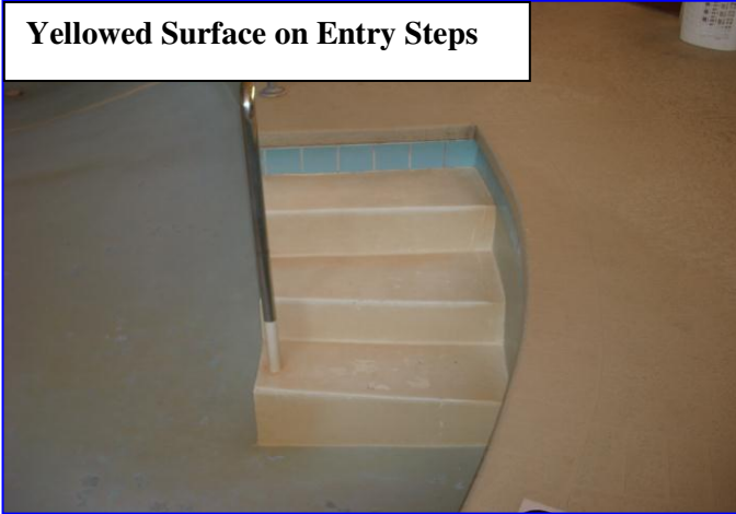
Yellowed Surface on Entry Steps