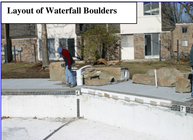
Layout of Waterfall Boulders