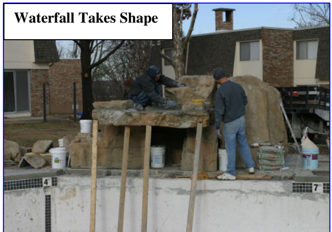
Waterfall Takes Shape