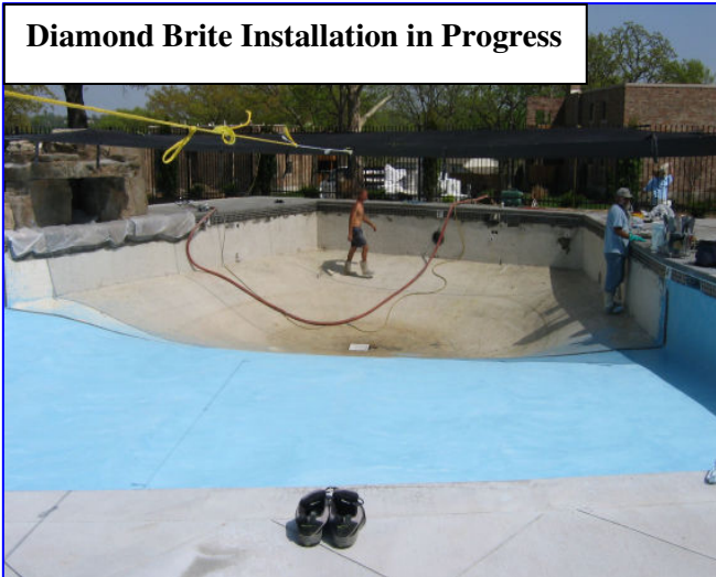
Diamond Brite Installation in Progress