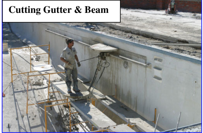
Cutting Gutter & Beam