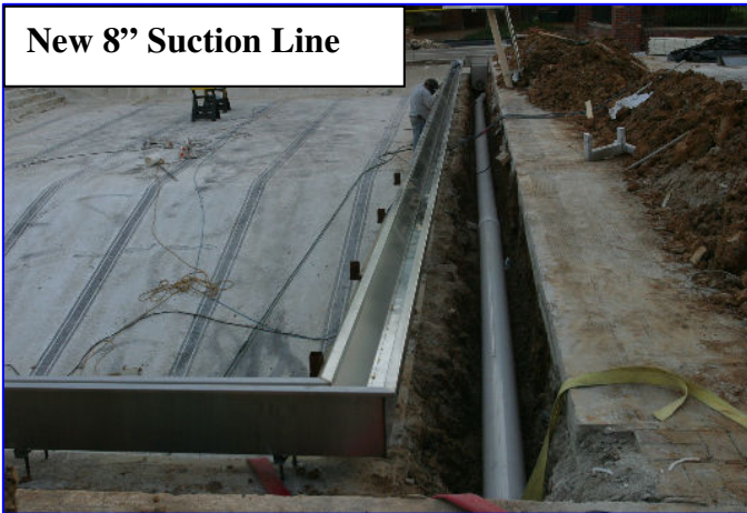
New 8" Suction Line