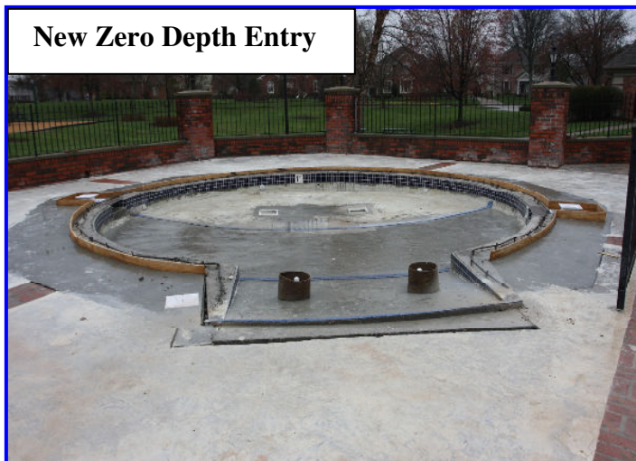
New Zero Depth Entry