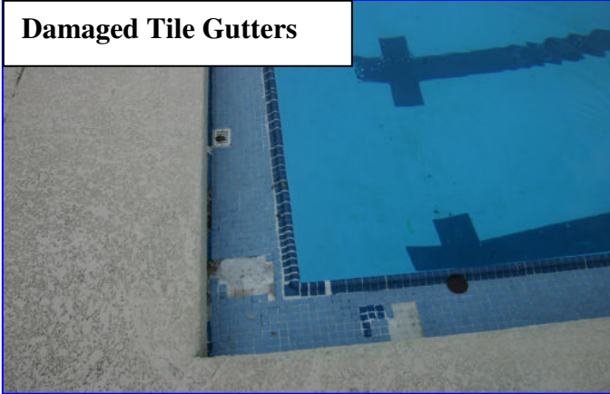
Damaged Tile Gutters