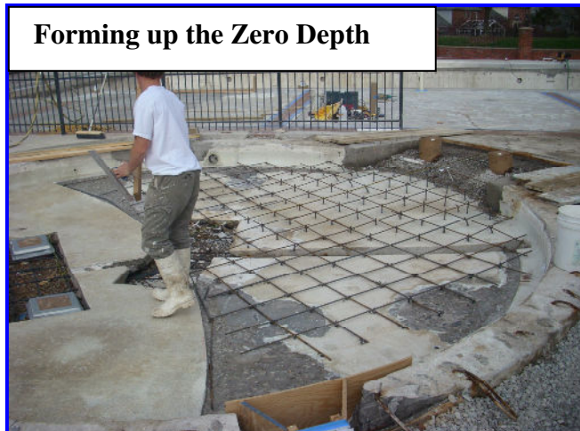
Forming up the Zero Depth