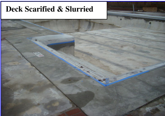
Deck Scarified & Slurried