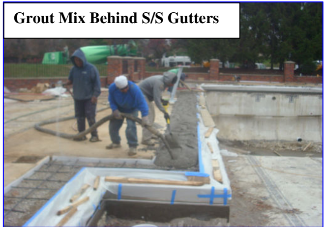
Grout Mix Behind S/S Gutters