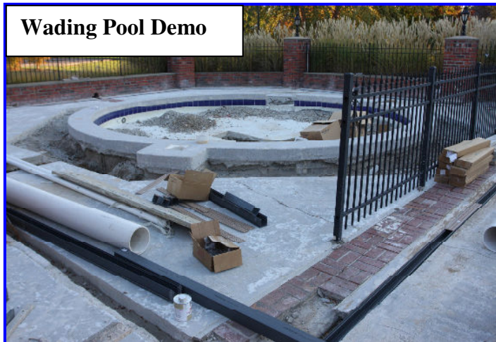
Wading Pool Demo