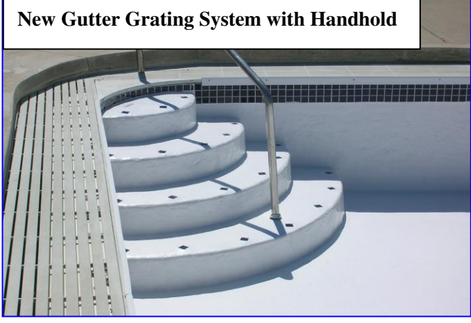
New Gutter Grating System with Handhold