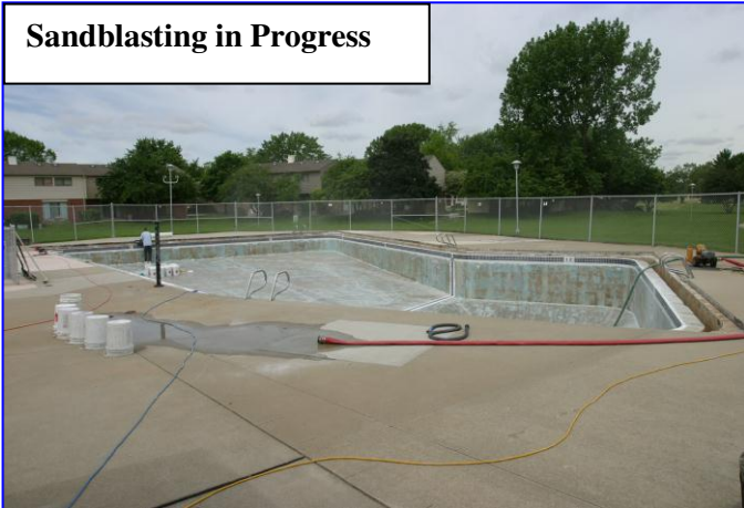
Sandblasting in Progress