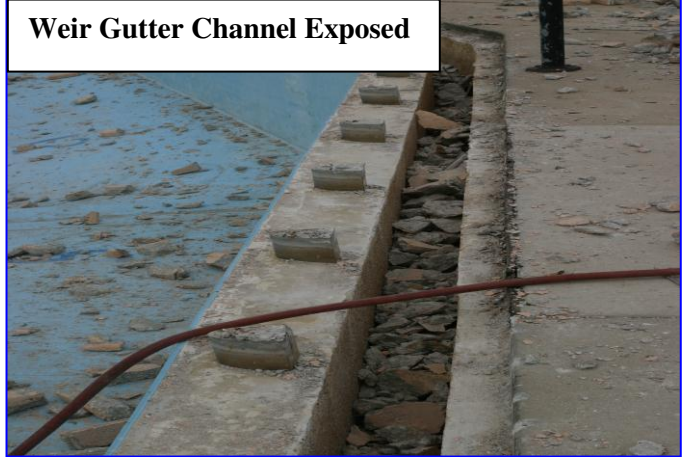
Weir Gutter Channel Exposed