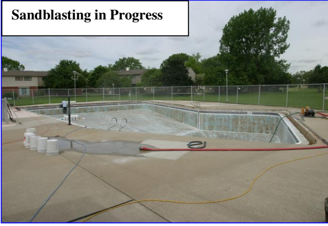
Sandblasting in Progress