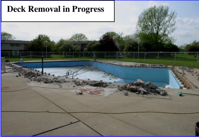
Deck Removal in Progress