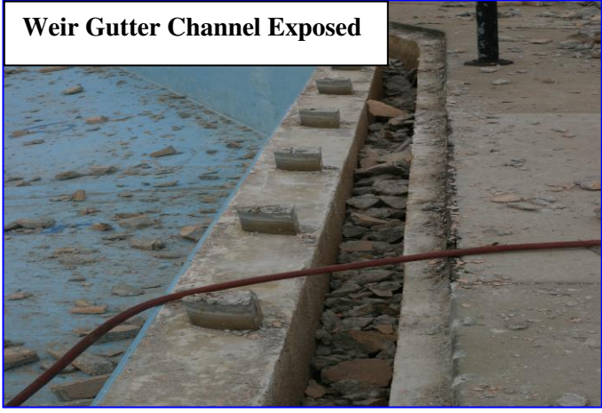
Weir Gutter Channel Exposed