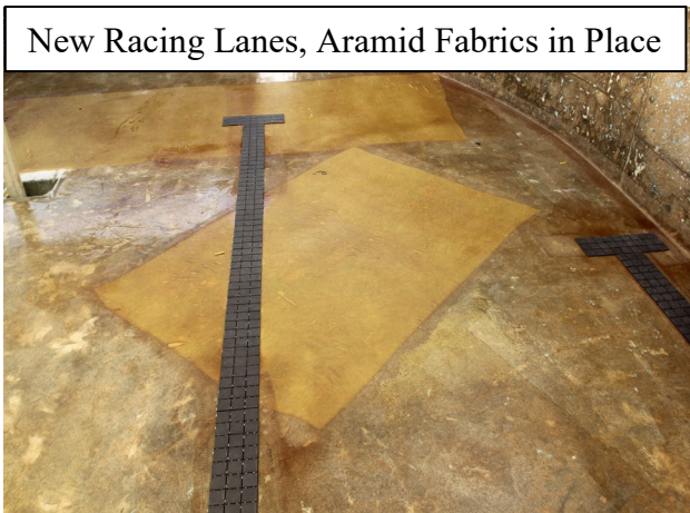
New Racing Lanes, Aramid Fabrics in Place