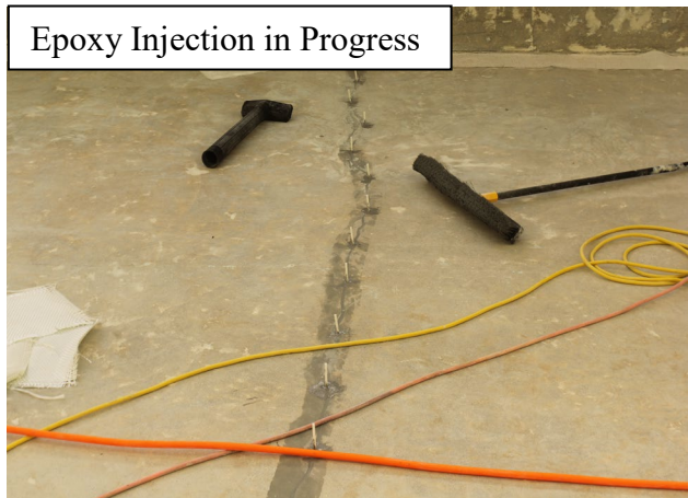
Epoxy Injection in Progress