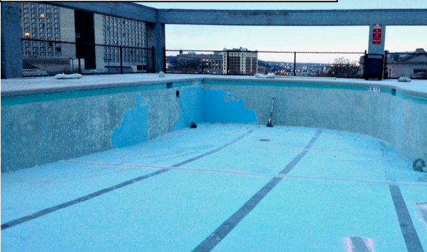
Paint Removal Underway